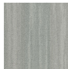
Ocean 72535 LRV 20.2