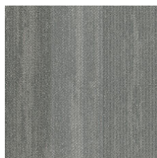
Island 72595 LRV 12.4