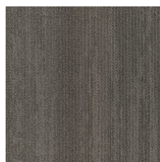
Market 72505 LRV 4.1