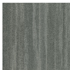
Adventure 72481 LRV 8.8