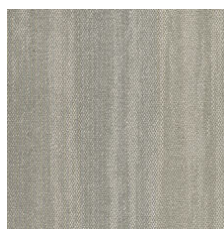
Scenic 72515 LRV 21.8