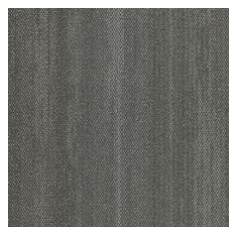
Urban 72557 LRV 7.2