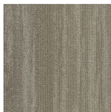
Earthy 72761 LRV 14.2