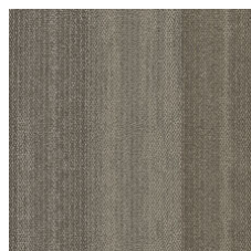
Village 72760 LRV 12.6