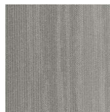
Metro 72530 LRV 14.4